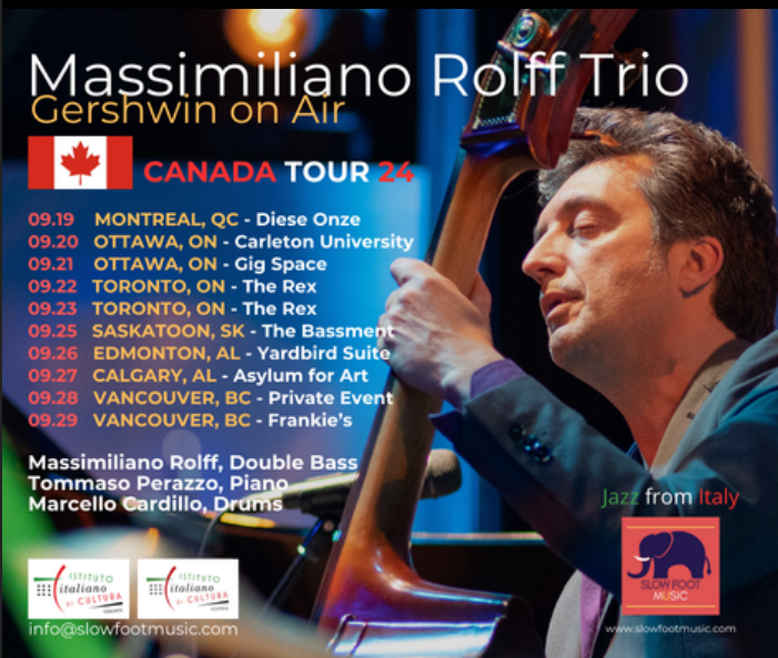
Jazz from Italy